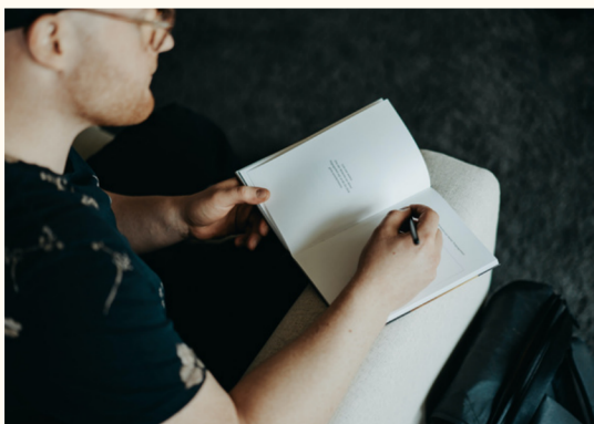
Self-Care for Creatives