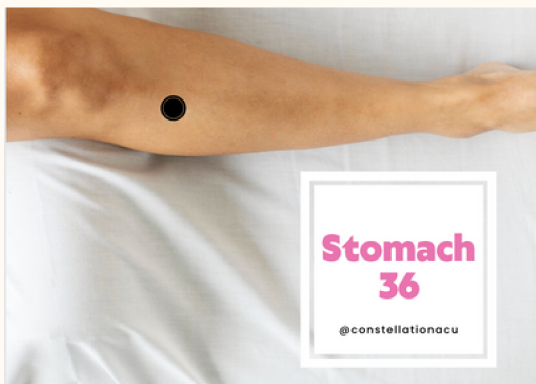
Intro to Acupressure

Many of our educational classes and workshops can also be delivered just as easily online via Zoom for increased accessibility depending on your organization's needs. Online class rates begin at $250. A few examples: