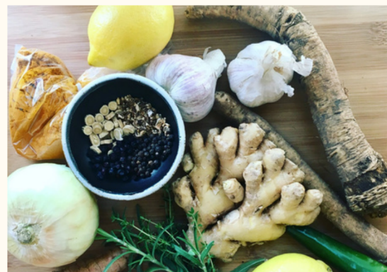
DIY Fire Cider